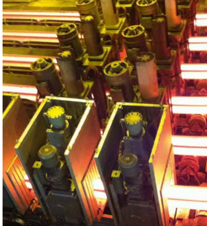
TBR opted for the Watt Drive K139 helical bevel gearbox, mounted on the plant shaft by means of a hollow shaft.